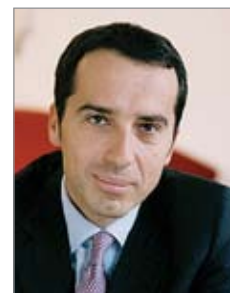
Mag. Christian Kern, Member of the Board, Verbund AG, Austria