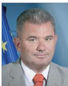
Mag. Andrej Vizjak, MSc., Minister of Economy of Republic of Slovenia